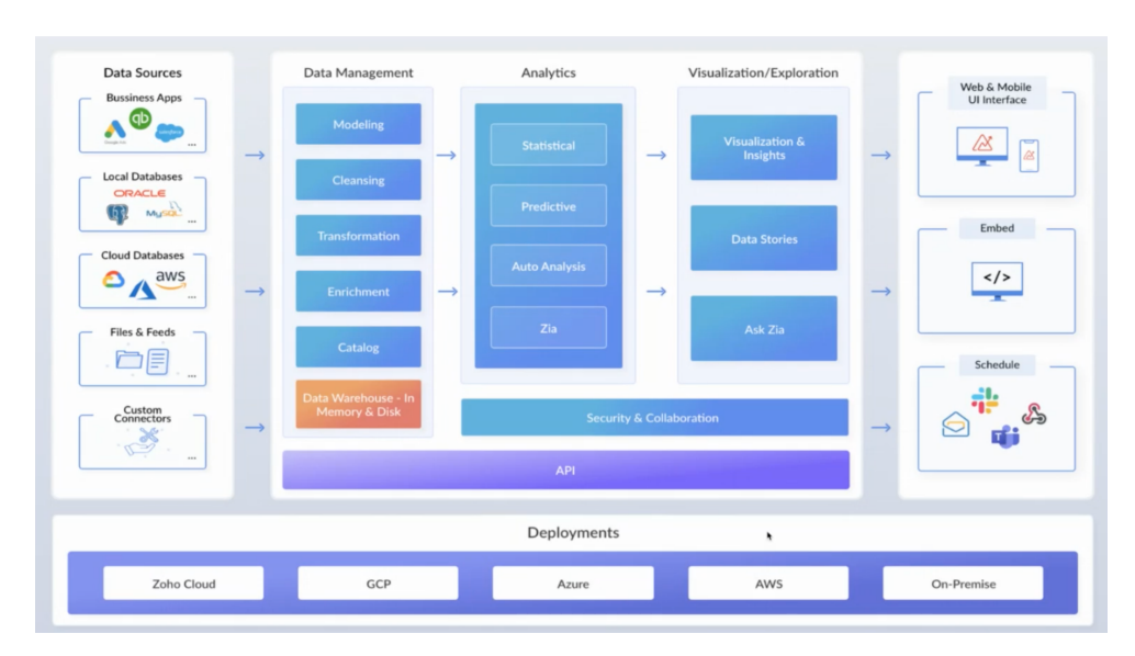
Figure 1: The Zoho BI and Analytics Platform architecture

The system can ingest data from around 250 data sources via its own connectors and expose insights via web based or mobile Uls. It can be embedded into other applications and reports can be scheduled and sent into a variety of channels, including Slack or Microsoft Teams®.