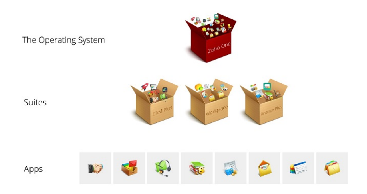
Figure 1. Current Zoho One Apps

There were 35 Zoho apps when the suite launched in 2017, and there are plans to have more than 50 apps available in 2020. All of these apps are under a single user login, with a uniform look and feel, and with transparent pricing of about $30 per employee per month with an annual subscription (for "all you can eat" features, with no obligation to use any unneeded modules). The suite pricing changes depending on whether it's for a dedicated user versus all employees and whether it's based on an annual subscription or month-by-month. For a named user, the price is $75 per month with an annual subscription.