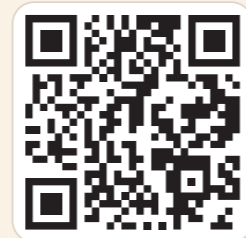
Scan QR code to know more about Zoho BugTracker