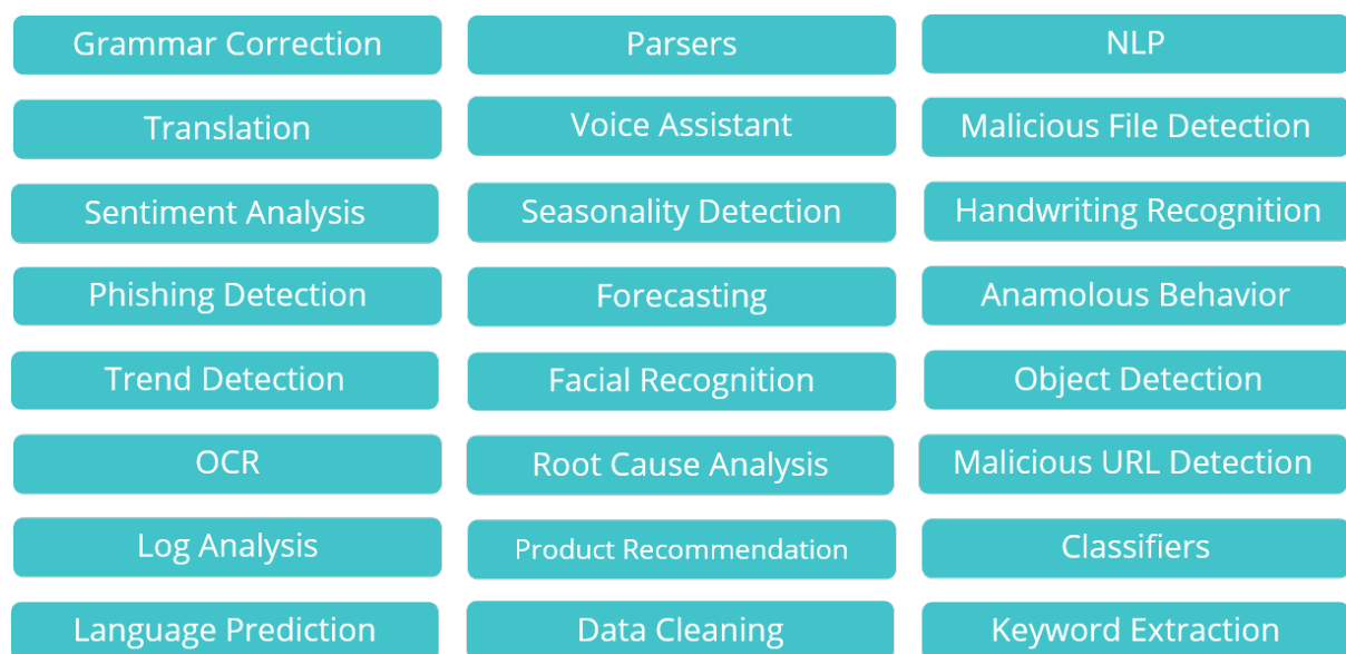
Figure 2: Zoho's broad array of AI capabilities and techniques

As AI has become more connected and sophisticated, real-time automation of responses is becoming more autonomous. Customer journeys are often chaotic and not necessarily linear. Customers may start their journey on one device, such as a smartphone, and then pause their journey, returning later on another device, perhaps a tablet, or decide to visit a store to complete their journey.