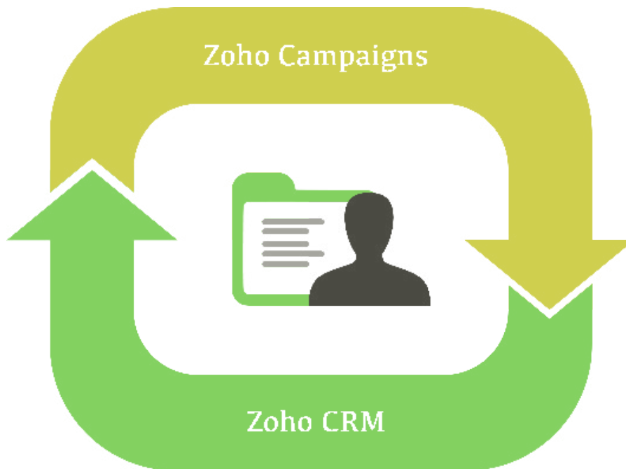
Sync contacts from Zoho CRM to Zoho Campaigns

By integrating Zoho CRM and Zoho Campaigns, sales teams don't have to wait for reports from marketing teams. This frees up time for sales teams to focus on bringing in more revenue. Syncing contacts between sales and marketing allows for: